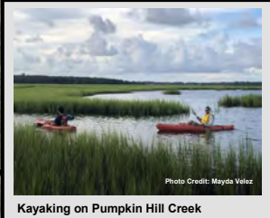
Kayaking on Pumpkin Hill Creek