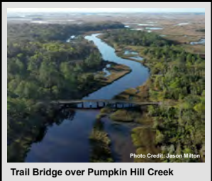
Trail Bridge over Pumpkin Hill Creek