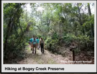
Hiking at Bogey Creek Preserve