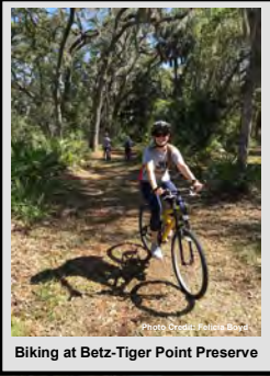
Biking at Betz-Tiger Point Preserve