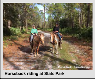
Horseback riding at State Park