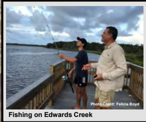
Fishing on Edwards Creek