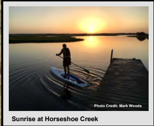
Sunrise at Horseshoe Creek